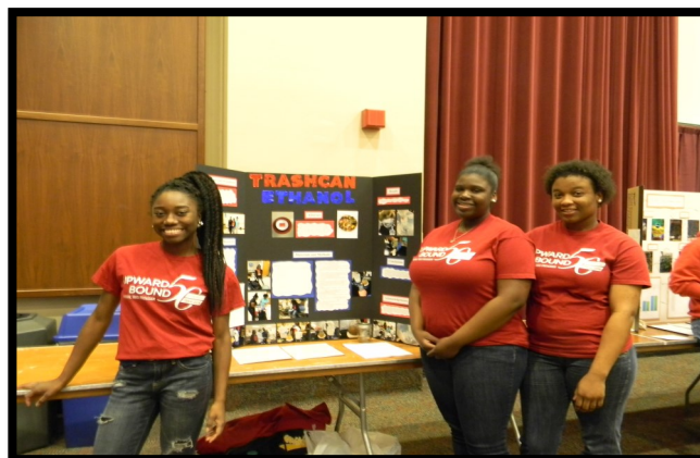
Participants stand in front of display at SIUE, presenting the results of "Trashcan Ethanol"

Research Center for their success and participation. We commend these three ladies because not only did they represent UBMS with great prowess but they also bring a greater representation to African-American women in the field of science. According to the National Center for Science and Engineering Statistics, African-American women only make up 2% of the entire Science and Engineering workforce. We are truly proud of our students!